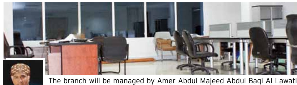
The branch will be managed by Amer Abdul Majeed Abdul Baqi Al Lawat and he will be looking after the overall sales and marketing activities.

Al-Amthal opened its newest branch in the Sultanate of Oman. After Bahrain, Qatar and Saudi Arabia, the Oman branch has been set up to cater for the enormous market potentials lying there in Oman. An agressive marketing campaign has been designed to make us visible enough among the prospects and to penetrate the unexplored market with focus.