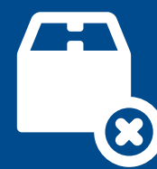
Cancel Delivery Notes