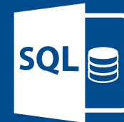
Microsoft SQL Database