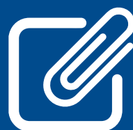
Supports Document Attachment