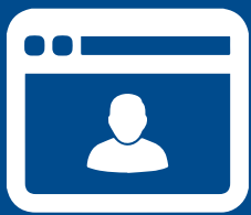
Customer Portal Dashboard